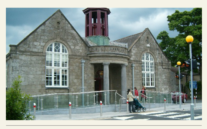
The new access ramp at the front door of Carnegie Library