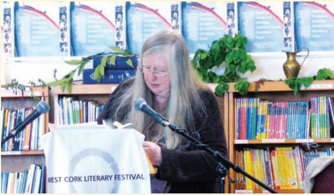
Eiléan Ní Chuilleanain