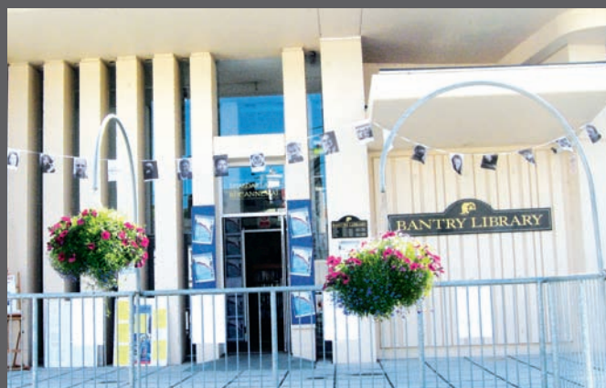
The bedecked Bantry Library