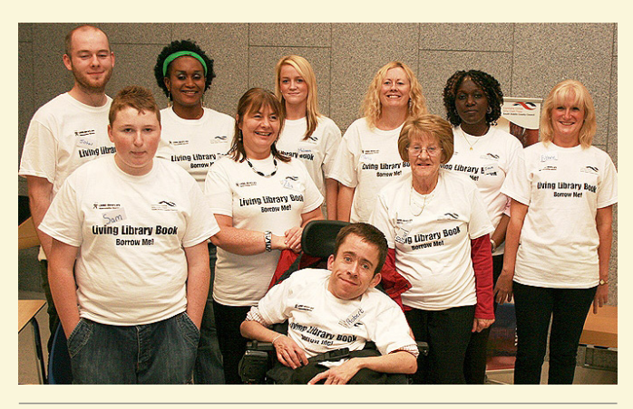
Recently returned 'Living Books'