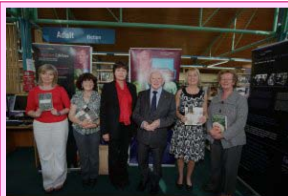
Professor Michael D Higgins & Anne Phelan, TD with library staff in Graiguenamanagh Library.

He signed copies of his books for many of the audience before he left for other engagements in the area as part of the festival.