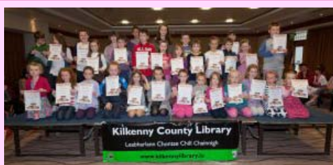
Group of children who succeeded in the challenge

with both children and adults. As part of the evening, the children were presented with their Certificates as Circus Stars and their CS Reading Medals. The material for the challenge was supplied by The Reading Agency in the UK. With this scheme, Kilkenny children joined with over 750,000 children in the UK, Ireland and worldwide in reading their way through the summer holidays.