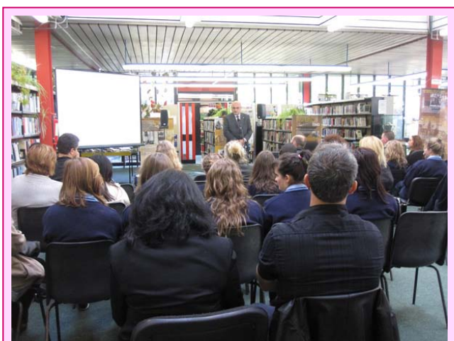
The Ambassador speaking to the audience including students from Coláiste Muire Ennis