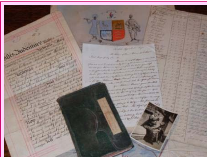
Selection of documents from Strokestown Estate Archive

The main objective of the Forgotten Voices exhibition is to provide a flavour of some of the themes and document types often found in estate collections, and to promote the importance of our documentary heritage. Estate archives provide one of the most valuable sources of local history in