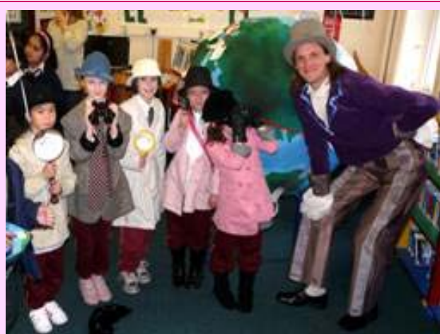
Phileas Fogg and detectives at the launch

Based on the Jules Verne novel Around the World in 80 Days , all under 18's are invited to travel to the 7 city library branches during the 35 days of the festival and partake in the varied programme of events. Phileas Fogg and Passepartout along with over 70 child detectives got this year's festival off to a most dramatic start. The group of 14 teenagers responsible for the design of the festival poster and brochure also attended. The paper craft art work featuring in the brochure and poster was created by the teenagers in workshops held in Cork City Library earlier this year and sponsored by Foras na Gaeilge. The bilingual poster is featured in bus shelters in the city centre and suburbs.