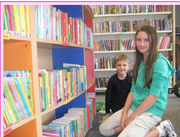
Children enjoying the children's area in the new library

The new library is a considerably larger space than the old Mitchelstown branch. The extra space means an increased book stock of approx 15,000 items including books, books on tape and CD, DVDs. The designated areas for children and teenagers