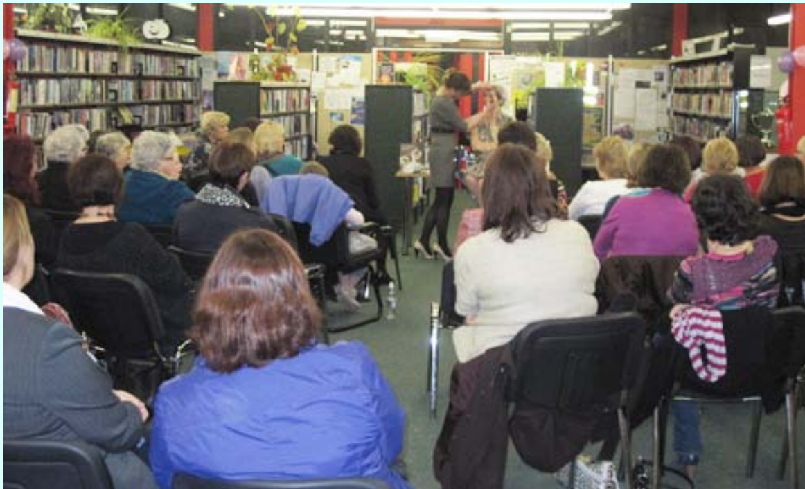
Attendees at the Girls' Night Out in De Valera Public Library, Ennis

Clare County Library celebrated Ennis Fashion Week (October 24 th -29 th , 2011) in style. A special Girls' Night Out was held at the De Valera Public Library, Ennis on Tuesday 25 th October at 7pm where attendees enjoyed an evening of glamour, style and, above all, fun! Experts were on hand to give all the hints and tips needed to prepare for any night out.