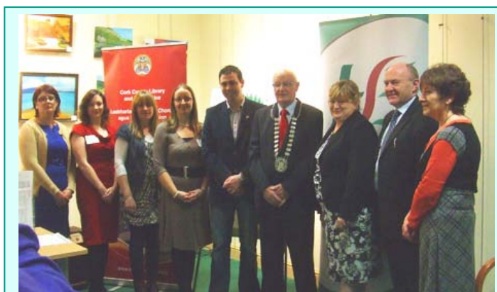
Organisers of Your Good Self programme at the official launch in Mallow Library

of their overall health. Meetings began in February 2011 around partnering the setting up of a community based positive self help programme. The main component of the Your Good Self programme is the bibliotherapy scheme.