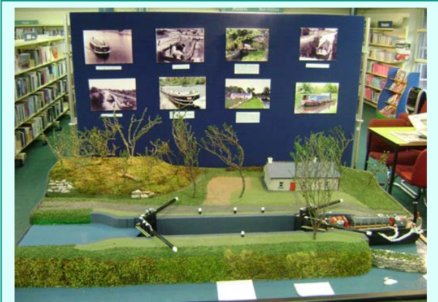
Model of Ballyellen Lock