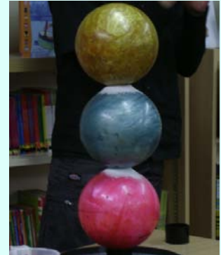
Model Balancing bowling balls with salt in between them. Adds flavour to the experiment.